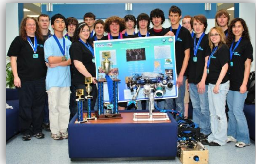
The 2010 MATES ROV Team, complete with poster presentation, completed vehicle, and Philadelphia, Pennsylvania Regional 1 st Place Awards