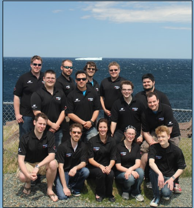
Company Picture, taken at Cape Spear, Newfoundland, the most eastern point in North America.