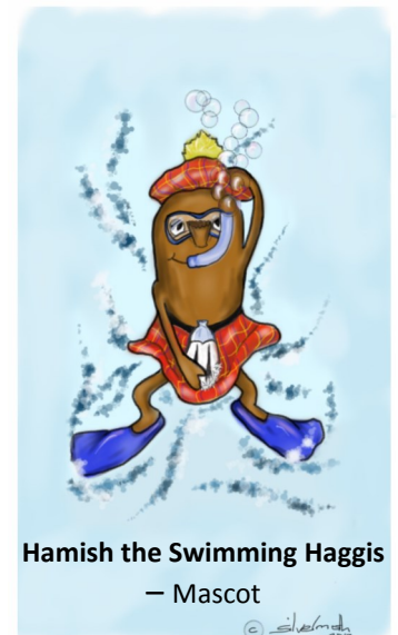
Hamish the Swimming Haggis — Mascot