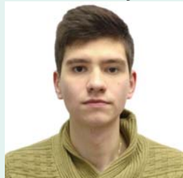
Main Pilot, Computer Vision Engineer 1st year participant