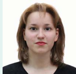
2nd Software Engineer 1st year participant