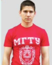
Team Supervisor, Risk Manager

Distance required to travel to the competition: 8370 km