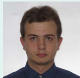
Chief Software Engineer 1st year participant