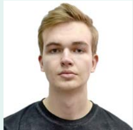
2nd Pilot, Designer 1st year participant