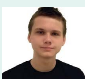
Technical Reporter, Travel Manager, CFO 1st year participant