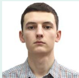
CEO, CTO 1st year participant