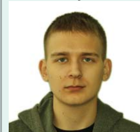
Chief Mechanical Engineer 1st year participant