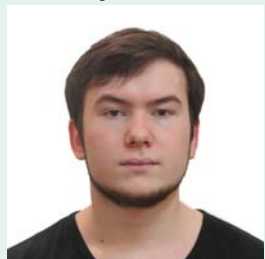
Chief Electronics Designer, Embedded Programming Engineer 1st year participant