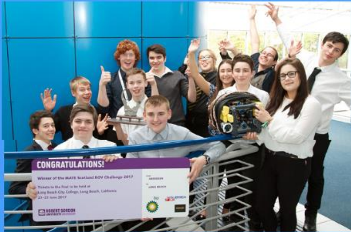
Improvise company photo RGU

This is Keith Grammar School's second year competing in the M.A.T.E. R.O.V. competition. Team is made of a mix of returning members and members who are new to the competition; as indicated below. All team members have collectively invested a total of 1528 hours each investing the equal amount of 127.3 hours.